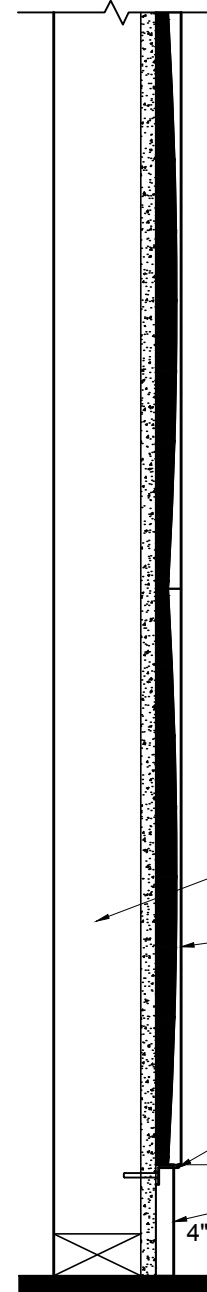
2 TYPICAL STUD WALL SECTION Scale: 1-1/2" = 1'-0"